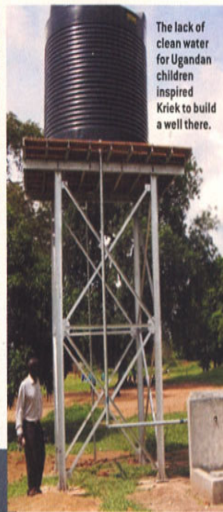
The lack of clean water for Ugandan children inspired Kriek to build a well there.